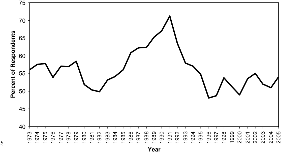
Figure 1. Percent of People who Think Their Country's Membership of the EC/EU is 'A Good Thing'

In other words, the choice is not between reforming the EU to promote political leadership and policy efficiency or reforming the EU to promote more politics and democracy. In reality, one cannot exist without the other. Policy reform will be impossible without more political competition and coalition-formation. In return, a more accountable and popular EU will be impossible unless the EU can live up to the demands and expectations of its citizens, and so undertake policy reforms in our interests.